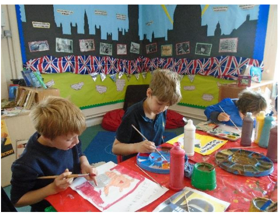
Jack and the Beanstalk by Year One and World War II propaganda posters by Year Six