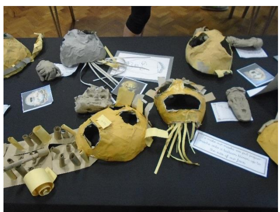
Reception portraits and Greek masks by Year Four