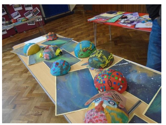
Stone Age inspired art in Year Three and the cosmos in Year Five